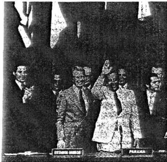
(U) President Carter and Omar Torrijos

(U) In 1968, a messianic officer of the Guardia Nacional named Omar Torrijos overthrew the left-leaning civilian government of Arnulfo Arias. Torrijos immediately took up the struggling negotiations with the United States as a personal call, and he guided his nation through relations with four American presidents (Johnson, Nixon, Ford, and Carter). Employing secret threats, bald intimidation, and diplomatic maneuvering that would make Machiavelli blush, Torrijos had, by 1977, placed the United States in a most uncomfortable position. Carter arrived in Washington determined to rid the United States of the festering sore of Panama.